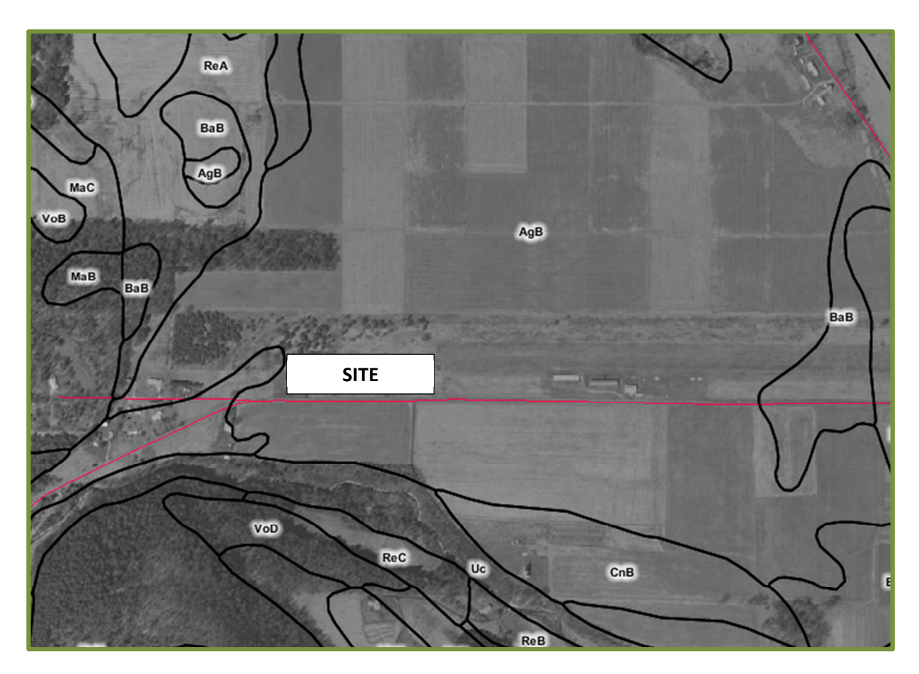
Figure 1. Soil Identification Map for Northeastern Pennsylvania Office Building

Another minor issue that arose during construction involved the identification of the pre-engineered metal building frames. There was an unidentified miscommunication between the pre-engineered building company and the steel fabricator as to how the frame pieces were to be labeled for the erectors to identify the pieces when constructing the building's structure. Rather than numbering the frames from South to North across the shop building, the frames were labeled from North to South. Since the frames were being installed from South to North, the contractor assumed the frames were labeled as such. This error was not found until frames 1 through 4 (Figure 2) were fully erected. The pre-engineering building company, who was also responsible for erecting the structure, had to deconstruct frame 1 and replace it with the proper frame. Frames 2 through 4, however, could remain in the incorrect positions because it was confirmed that they were all identical frames. With the project slightly ahead of schedule, the contractor was able to correct the error during their standard working hours without negatively affecting the project schedule.